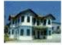
Penang Sunshine Home

Home for elderly people filled with WARMTH and COMFORT. Our Sunshine Home provides 24-hour quality service, pleasant surroundings, friendly and professional staff.