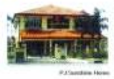
P.J. Sunshine Home

Home for elderly people filled with WARMTH and COMFORT. Our Sunshine Home provides 24-hour quality service, pleasant surroundings, friendly and professional staff.